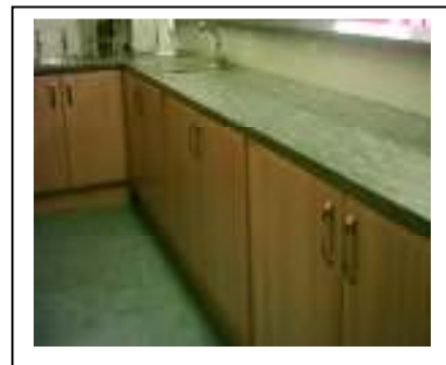
The refurbished snack area at Bewsey Barn – see page 2

The Parish Council has started a programme of refurbishment at the Community Centres. In Autumn they paid to resurface the netball and 5 a side courts at Tim Parry Community Centre; replaced the old curtains with new blinds in the main hall; replaced the central heating boiler and upgraded the lighting there.