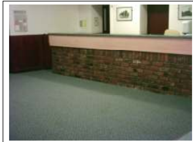
A view of the carpeted area and the snack counter at Bewsey Barn