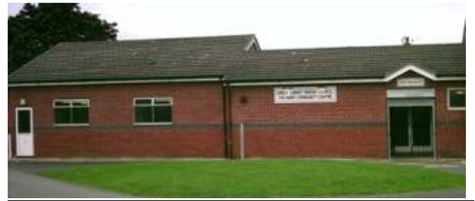
Tim Parry Community Centre, Cromdale way